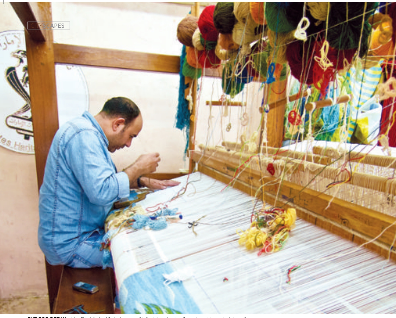
EYE FOR DETAIL: Abu Dhabi's textile industry, with its intricate details and quality materials, will seduce any buyer.