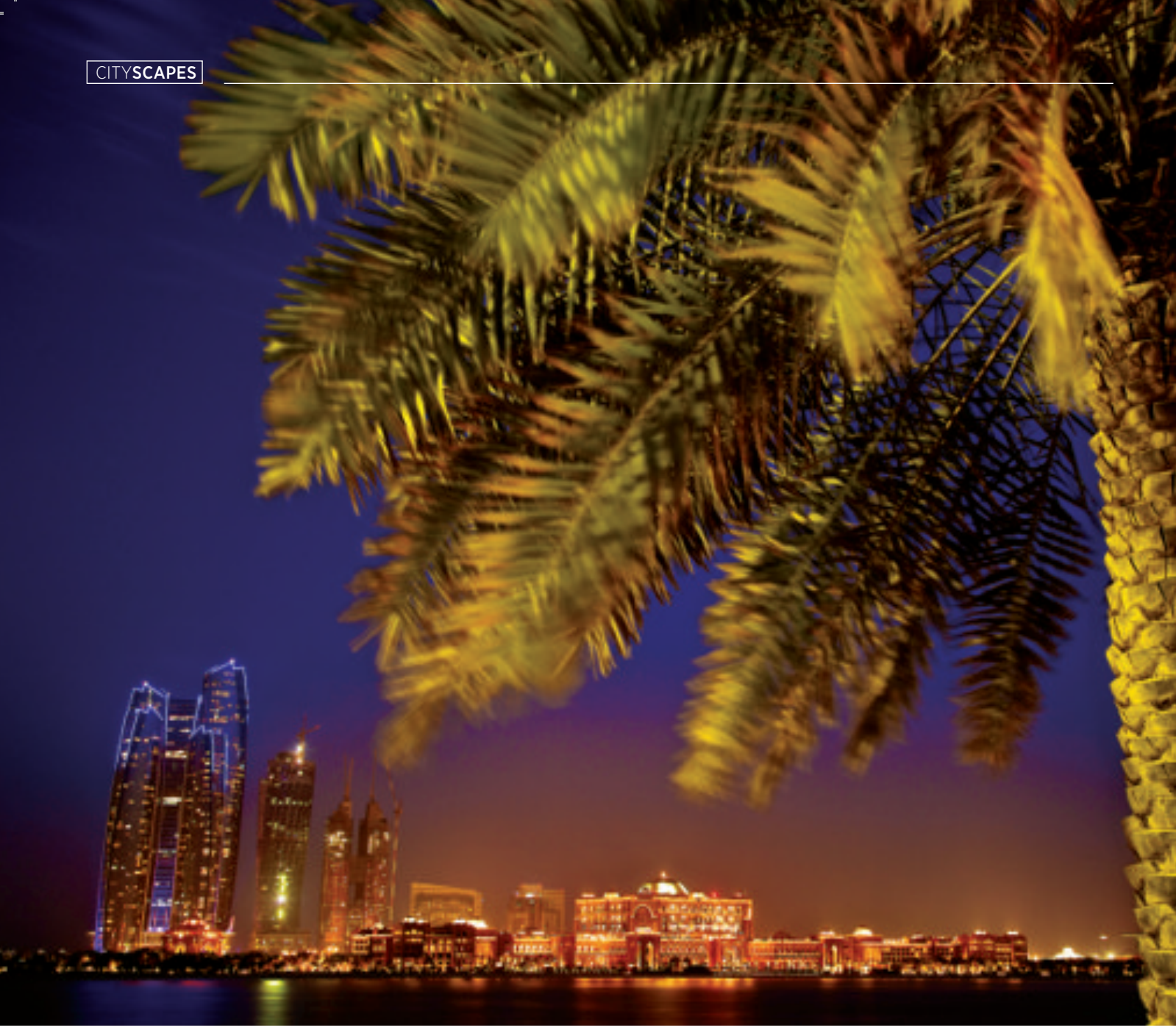
DESERT GEM: As the UAE's capital, Abu Dhabi has ambitious plans that can be clearly seen with its world-class architecture.